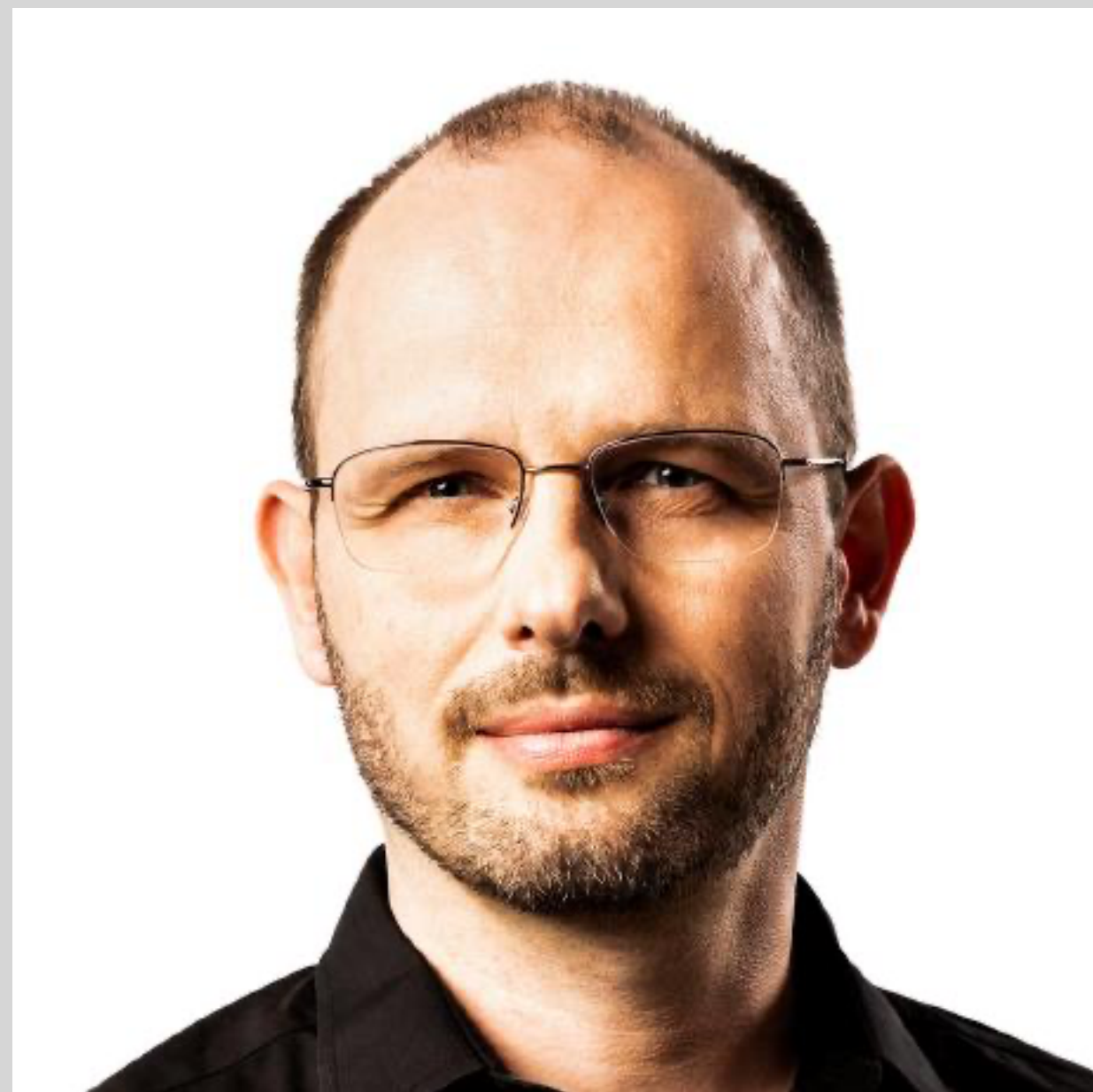
Thomas Dohmke CEO of GitHub